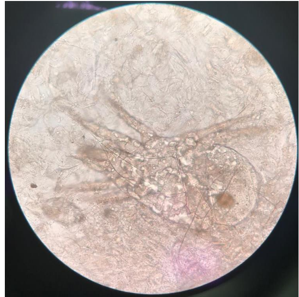
Fig. 3: Adult of Dermatophagoides pteronyssinus (European house dust mite)

The patient was treated with Permethrin (cream), Xylocaine spray, dilute acetic acid (vinegar), and three ear canal aspirations. After three days, the patient's ear was re-examined, and the number of mites had greatly decreased within the EAC. Follow up consultations confirmed the eradication of the mite infestation.