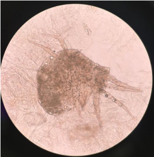
Fig. 1: Adult specimen of Dermatophagoides pteronyssinus (European house dust mite)

During the examination and using a Xion-endovision MD 2111, a video recording revealed hundreds of active mites of varying life stages (adults, nymphs, etc.) and their eggs within the moist inner surface of the External Auditory Canal. Following their removal from the ear canal using a Q-tip, the samples of mites were slide-mounted for microscopic examination. Digital images were taken using light microscopy (Olympus-Cx31, Japan) of the slide-mounted (Figs. 1, 2, and 3). Additionally, during the pre-treatment period, a one-minute video recording was made during otoscopic examinations of the patient. There were no limitations in order to carry out this research.