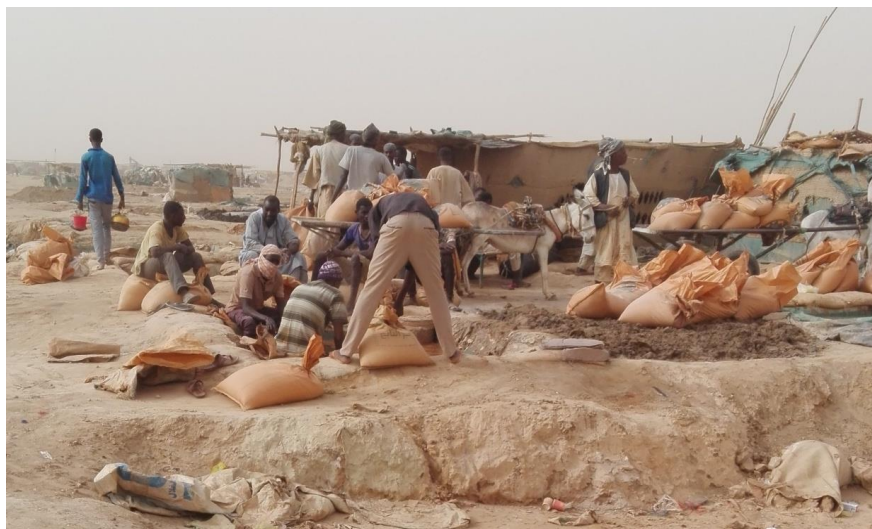
Fig. 3: Sacks contains sands, gravel, and rock they may contain gold