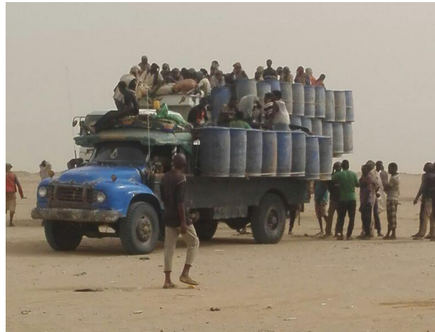
Fig. 2: Transportation of miners

areas in the artisanal mining community.