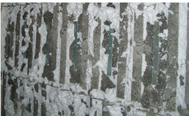
Fig. 3: Fragment of a wall with the removed layer of EPS formwork

Such defect is not critical, but is subject to mandatory resolve. The divergence of formwork panels due to the increase of thickness of RC wall and causes a decrease in thickness of thermal-insulation layer of EPS. Decrease of thermal-insulating layer is associated with the possibility of freezing of wall in winter. To resolve the defects, it is necessary to cut off a significant portion of EPS formwork with the need for designed vertical position of wall without anomalous irregularities. Fig. 3 shows a fragment of wall with the removed layer of EPS formwork.