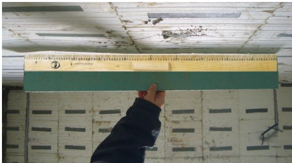
Fig. 1: Identified deviation of ceiling surface from the design position

Technological defects of cast-in-situ RC structures, built in the permanent EPS formwork, revealed during the visual inspection (Fig. 1).