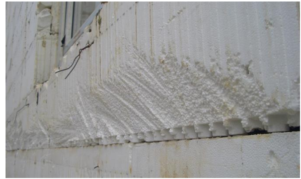
Fig. 4: Fragment of the outer wall with defect, "rectified" flush

some activities for its improvement. Fig. 4 shows a fragment of outer wall, prepared for finishing work.