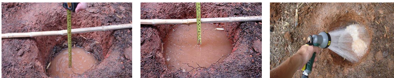
Fig. 2: Experiment procedures for the determination of water permeability coefficient

Among wastewater pollutants parameters, the maximum difference in terms of standard of discharge into surface waters was observed in COD which the main resources for its formation are included in the wastewater of chemical wastes (30 to 50%) and industrial uses (20 to 30%). Based on the information of this study, the minimum and maximum per capita pollutions in output sewage from system are related to TSS pollutant of aerobic system equal to 3.5 mg/L and COD pollutant of anaerobic system equal to 301 mg/L, respectively (Crook, 1999).